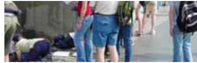
and at the Vietnam Memorial