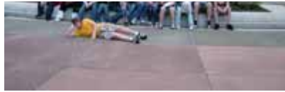
8Th Grade in Washington, DC...