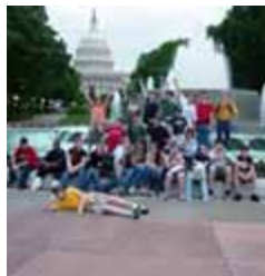
8th grade in DC