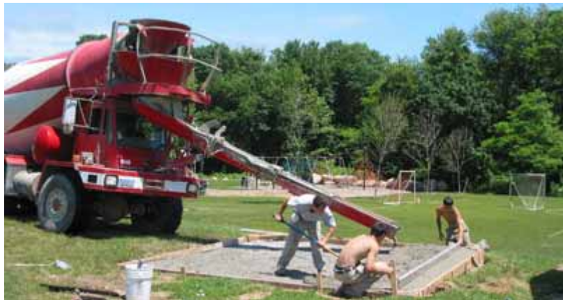
Pad for Astronomy Hub

With aspirations of further strengthening our science program, an observatory will be installed this fall. Resting on a custom designed platform and vibration-free platform, the 14" Meade telescope will have the capacity to be operated from a home computer and track celestial objects at any time. An additional observation platform will be laid beside the observatory. The School plans to house several telescopes to be used by the Pine Point community as well as other outside groups who have partnerships with the School.