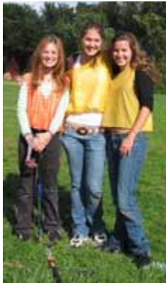
10th Annual Alumni Soccer and Field Hockey Game More info>